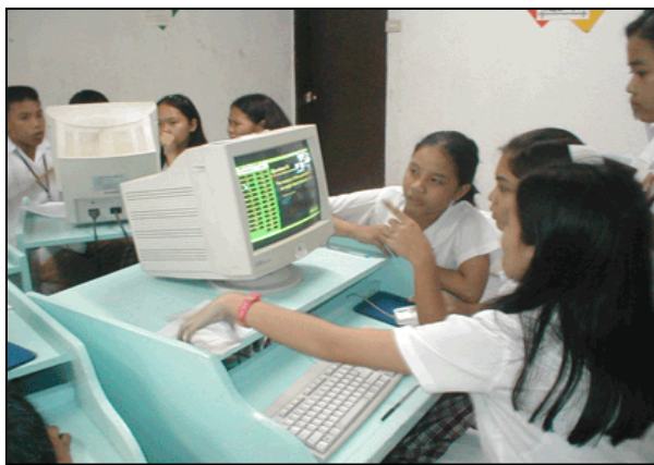
Figure 3: Students competing in a game.